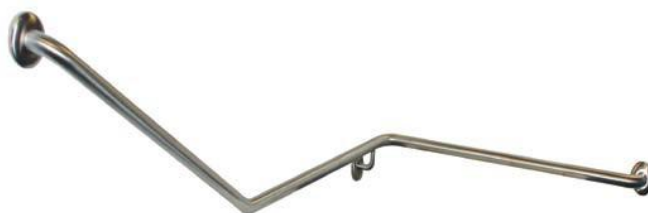
MLR 113 (L/H in-situ depiction)