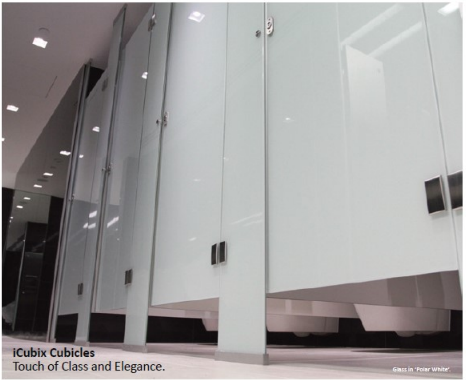
iCubix Cubicles Touch of Class and Elegance.