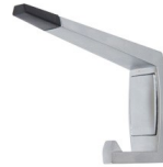
Metlam Moda Bumper