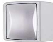
Metlam Moda Spring Hinges