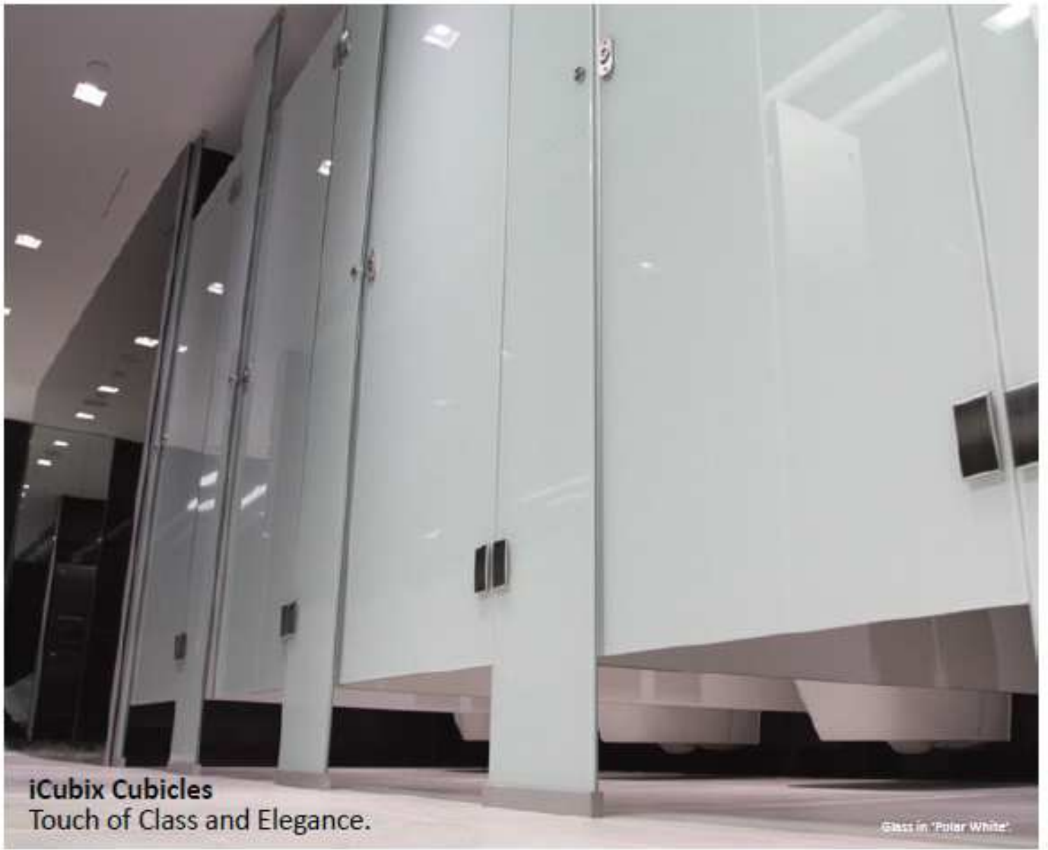
iCubix Cubicles Touch of Class and Elegance.